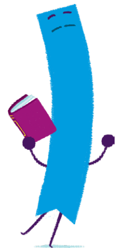
ILLUSTRATION Rob Biddulph

Changing lives through a love of books and shared reading.